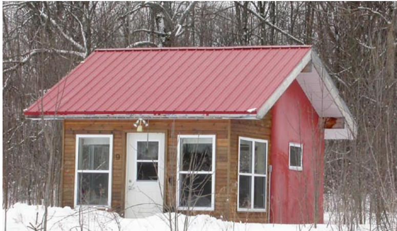
Close-up of Cabin (accommodation for 4)