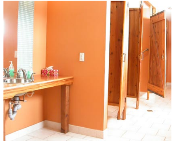
Washroom and showers in main building