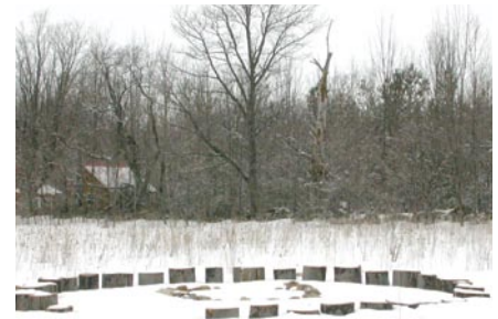
Tree stumps for sitting around the Fire pit