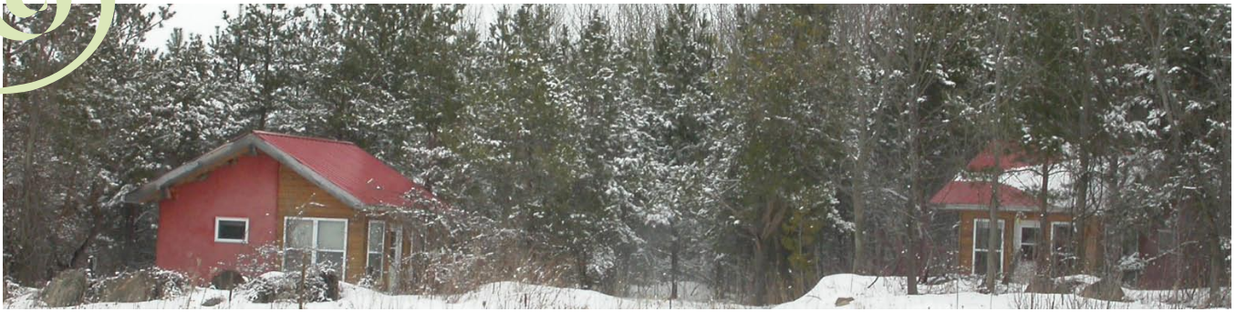
Individual Cabins in the wood (accommodation for 4)