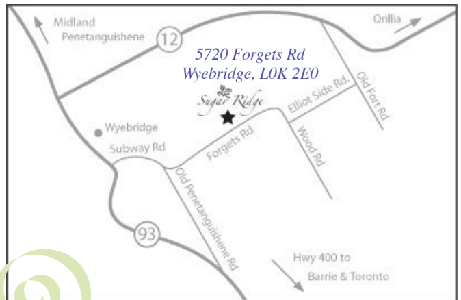
exit 121 on Hwy 400, turn right to Hwy 93, Midland/Penetanguishene