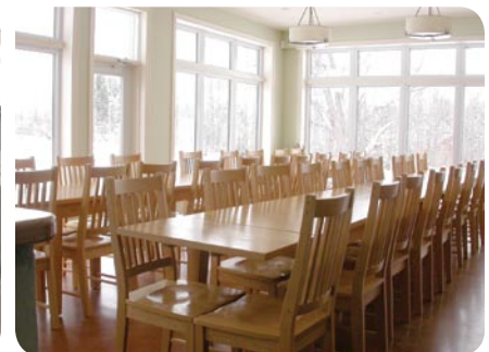
Dinning area next to the Kitchen