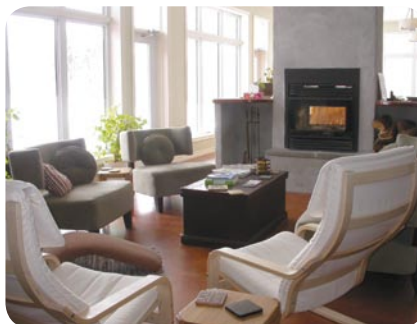
Lounge with Fireplace